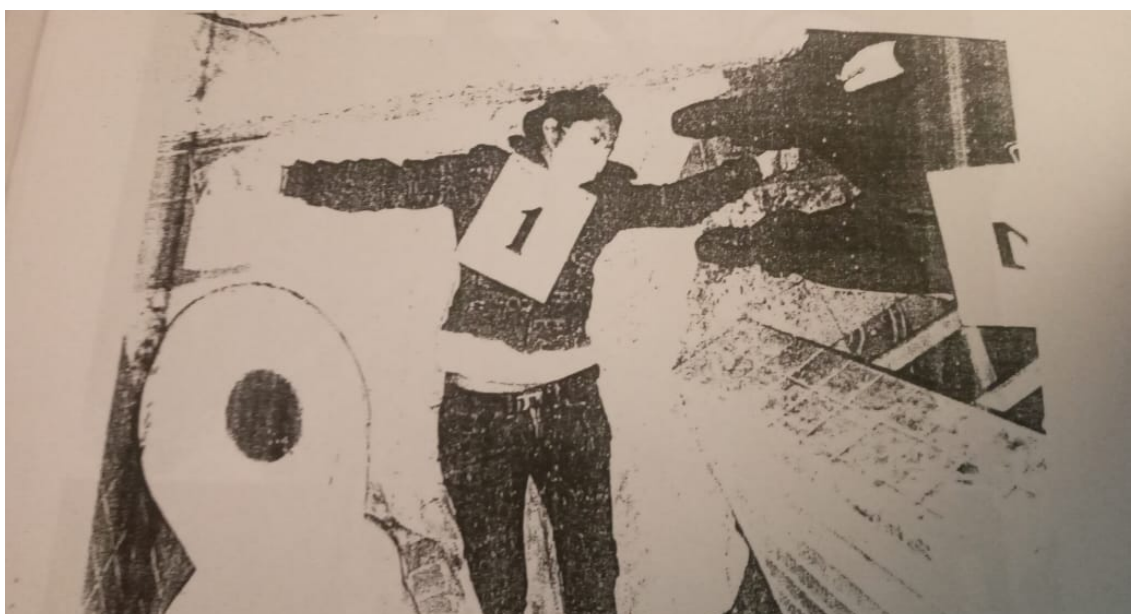
Reconstruction of the crime scene from the expediente.